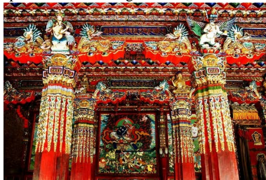
Fig.6 Tibetan traditional auspicious pattern roof decoration

The roof is the object inside the traditional Tibetan building to cover the upper part of the beam. The traditional Tibetan auspicious patterns in the ancient roof decoration are usually decorated with paintings or carvings, and the Tibetan auspicious patterns occupy a large area in the scope, but modern [5]. The roofs in the interior design are mostly white, or in the form of Tibetan traditional auspicious patterns made of modern materials, or the original material color. There are algae wells on the ceiling, colored paintings on the roof, beams. There are also colorful paintings and carvings throughout the day. The center of the roof panel is painted with various auspicious patterns such as dragons, phoenixes and flowers, as shown in Figure 6. The painted ornament on the roof is closely related to the location and purpose of the building.