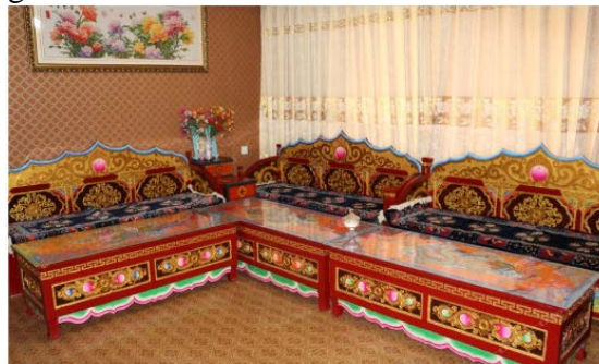
Fig.4 Traditional auspicious patterns of furniture decoration

The traditional auspicious patterns of furniture in modern furniture design should reflect a certain degree of moderation, so that people can relax from the busy life, with the development of science and technology, engraving, inlaying, painting, snails, ironing, lacquer and other traditional decoration. The technique is the main method of expressing traditional auspicious patterns [4]. The six small lotus gates of the Huizhou-style residence Zhicheng Hall are hollowed out, a group of children's spring pictures, some dancing dragons and phoenixes, some knocking drums. In addition, techniques such as thin wood parquet and screen printing can also be properly expressed in furniture. A variety of techniques are often used in furniture decoration to achieve the best effects of various decorative techniques, making the artistic expression and aesthetic effects of auspicious decorative patterns more diverse, as shown in Figure 4.