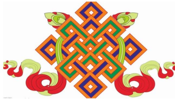
Fig.2 Cultural connotation of Tibetan auspicious patterns

The Tibetan traditional auspicious pattern is a unique and splendid artistic treasure of the Chinese nation. It has a wide range of subjects, rich in content, diverse forms and long-standing traditions. It is difficult to replace other art forms and is an intangible cultural heritage that Tibetans are proud of. The reason why Tibetan traditional auspicious patterns can prosper in the field of interior design is because it has great aesthetic value and can provide rich design elements for modern interior design and become an important performance theme of modern interior design [2]. The combination of traditional Tibetan auspicious patterns and modern interior design is not only reflected in the simple use of traditional auspicious patterns, but also in the inheritance and promotion of the long-standing cultural connotations, folk customs and life etiquette of traditional auspicious patterns, as shown in Figure 2.