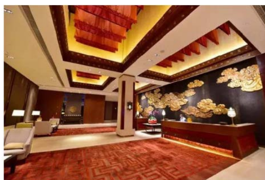
Fig.5 Auspicious pattern floor decoration style

Auspicious patterns are applied to the floor decoration. In the modern interior design, people advocate a simple and bright style. The floor is mostly flat and plain stone or plate paving. The large-scale use of pattern decoration on the ground design will give people a cumbersome and extra feeling [4]. You can choose a small area. In general, only in a special functional environment, in a large public place, a variety of stone elements are used to express the collage content. There are various patterns, such as square, polygon, circle, ellipse, etc., as shown in Figure 5. The pattern