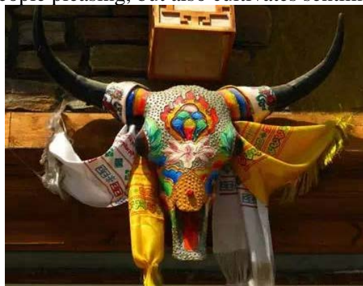
Fig.7 Tibetan cow head decoration

Interior furnishings mainly refer to indoor furniture, equipment, decorative fabrics. Design and processing of artwork, lighting fixtures, etc. For example, in the study room, root carvings, Tibetan paintings, handicrafts, antique desk bookcases, etc., these furnishings can create a cultural atmosphere, so that people can learn from this, further stimulate people's curiosity, as shown in Figure 7. From this point of view, the use of traditional Tibetan auspicious patterns in the indoor environment is not only decorative, but also has a certain cultural connotation [6]. This kind of furnishings not only makes people pleasing, but also cultivates sentiment.