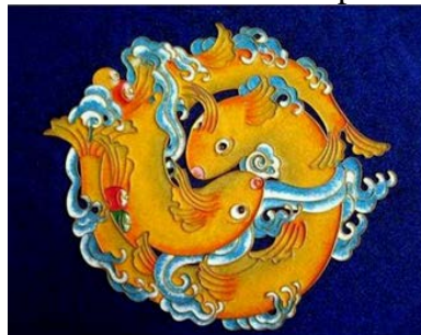
Fig.1 Tibetan traditional auspicious pattern

In ancient times, predecessors created many auspicious patterns that yearn for the pursuit of a better life. We have these certain historical features, certain folk characteristics, and a pattern of auspicious blessings. It is called the Tibetan traditional auspicious pattern [1].