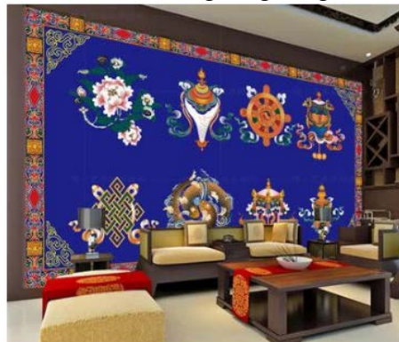
Fig. 3 Traditional pattern on the wall

Traditional auspicious patterns are widely used in modern residential interior design, and both interior design and interior design have their place. The traditional auspicious patterns can be expressed indoors by decorating the enclosing interface and selecting interior furnishings decorated with traditional patterns [3]. The enclosure interface is the wall, the ground, the ceiling, the entities and semi-solids including the separation space, and the interior furnishings mainly refer to interior furniture, equipment, decorative fabrics, furnishings, lighting fixtures, and the like.